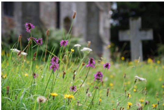
Oldberrow Church, Worcestershire